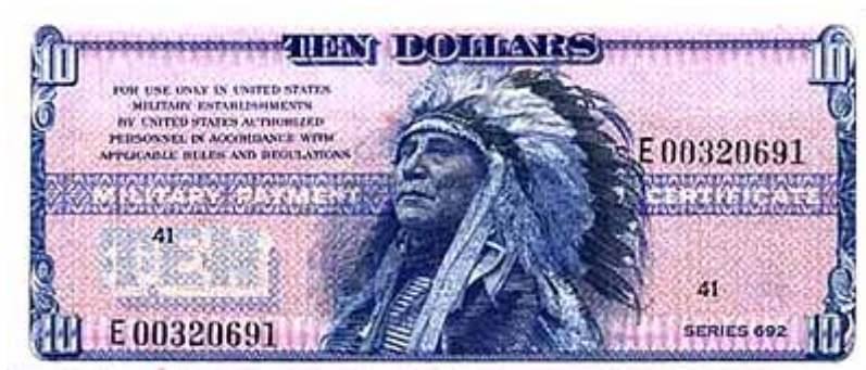
A Series 692 $10 replacement Military Payment Certificate.

The first series of Military Payment Certificates was issued in September 1946. To discourage illegal use, series were changed without warning. These conversions, called "C days," were unannounced and strictly controlled. Personnel were restricted to their compounds, and only authorized users were allowed to convert their MPCs into regulated amounts. If a serviceman had more money than he should, he was detained for questioning.