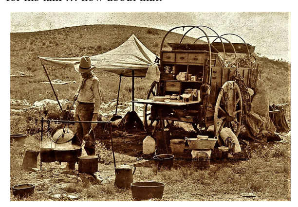
One of the daguerreotype photos of the old west.

He graciously agreed as many of his photos capture what life was like in many western towns and mining for gold and silver camps in the late 1800s. The Broadmoor resort show venue is the perfect backdrop for his talk ... how about that!