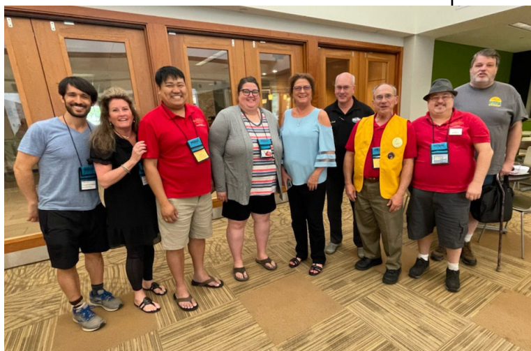
Photo: Attendees at ANA District Representative meeting held onsite at Summer Seminar 2022.