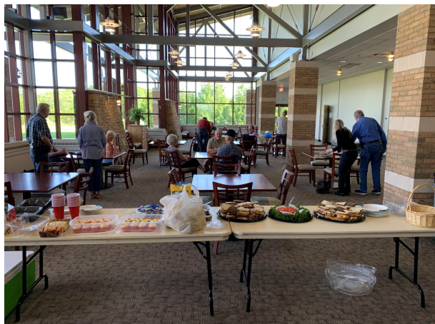
Photo: MCC Members at club picnic.

The Mountain Coin Club (MCC) meets in Blairsville, Ga. The May 10 meeting was the club's annual picnic. The club provided the food and drinks, and members brought desserts. The event was held indoors at the North Georgia Technical College.