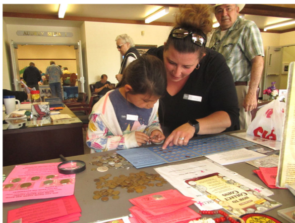
Photo: YN and mother enjoying the penny search activity at the SMCC May coin show.

The next SMCC show is slated for Oct. 29. For more club or show information contact Linda Nash at: lnash@verizon.net , or call (805) 937-1250.