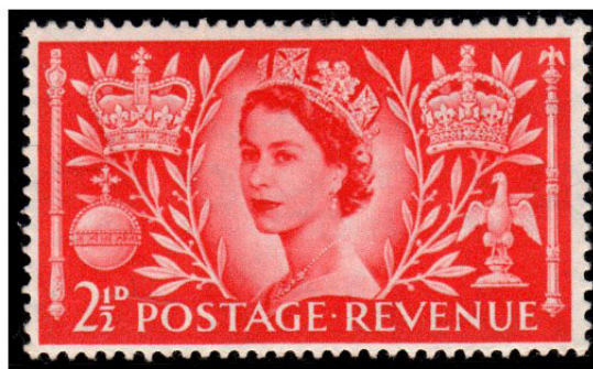
Photo: British 1953 2 ½ pence coronation postage stamp.