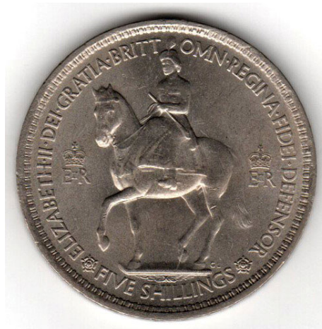
Photo: 1953 British coronation crown depicting the Queen on horseback.