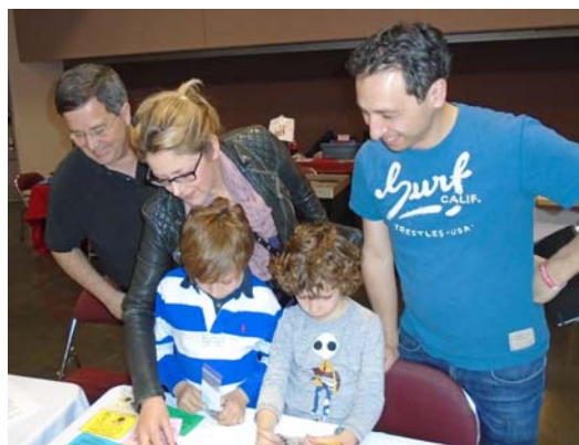
A family looks over the Coin Treasure Hunt items to be found before embarking on it. Their eyes are aglow as they pick up an information card with a silver Mercury dime.

The Cupertino Coin Club, NASC and ANA through their onsite presence reaped great membership rewards. Between the three groups, 31 individuals were signed up as new members.