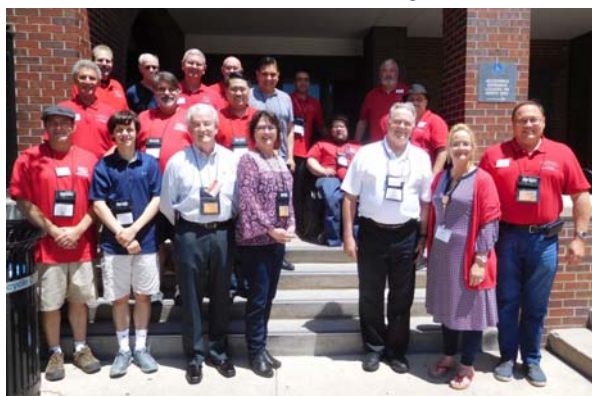
District & Club Representatives group photo at the 50 th ANA Summer Seminar on June 18, 2018.