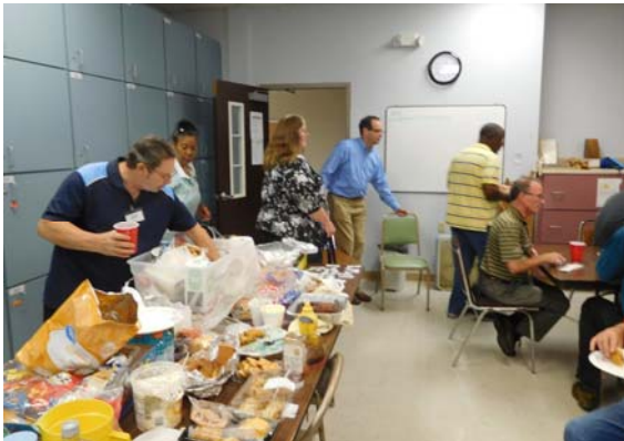
MCCC members at the potluck dinner with plenty of food to go around.

The club's June 26 Independence Day celebration potluck dinner, buy/sell/trade night and auction was a great success with the meeting room full of people. The event took the place of the regular MCCC monthly meeting. There was plenty of food to go around, and the auction sold everything except one lot.