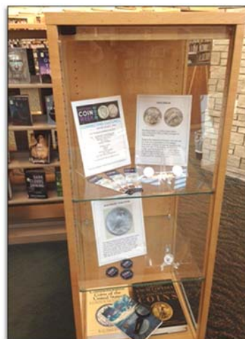
NCW exhibit at the Milford Library.

The simple exhibit at the Milford Library featured the U.S. Peace Dollar – a silver coin with a design emblematic of the peace that followed World War I. The more elaborate exhibit at the Cromaïne Regional Library featured the Peace Dollar as well as the Euro – the common currency of the European Union currently used by 19 of its 28 members. Both also displayed a selection of numismatic publications.