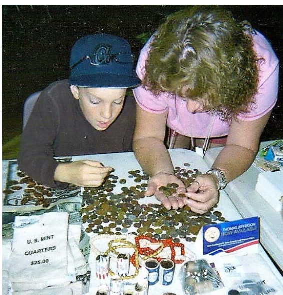
A mother and son build a foreign coin collection at the SMCC show.

The club celebrated its 60 th Anniversary in Oct. 2017 with a special commemorative edition of ANACS slabbed Kennedy half dollars. Only 100 were produced. The SMCC meets at 7 p.m. on the third Wednesday of each month at the Edwin Mussell Senior Center, 510 East Park Ave, Santa Maria. Dues are $20 per year. For further information and show bourse tables contact: president@santamariacoinclub.com .