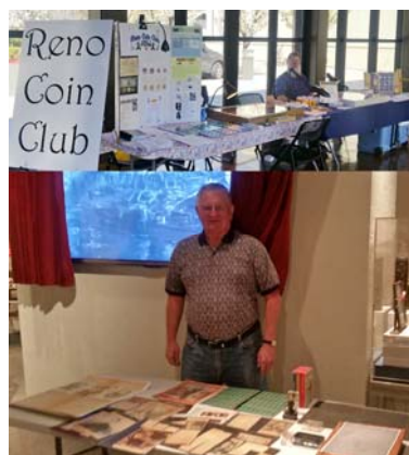
Two scenes of the Reno Coin Club at the Nevada State Museum.