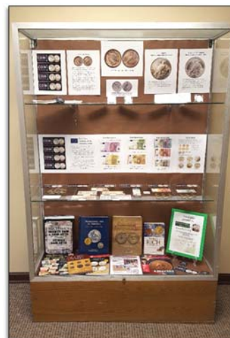
NCW exhibit at the Cromaïne Regional Library.