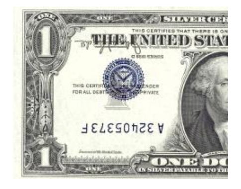
$1 bill with upside down serial numbers.

A $3 million nickel and extraordinary misprinted currency can be seen at the family-friendly National Coin & Money Show®, March 28-30, 2019.