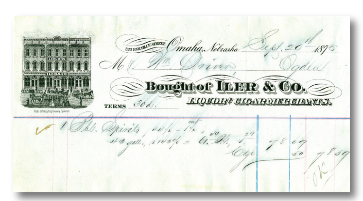
▲ ILER & COMPANY INVOICES were printed by Krebs Lithography of Cincinnati, Ohio.