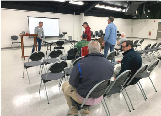
MCCC Members start to arrive for Feb 15 meeting.

Information on the MCCC can be found on its website at http://mccc.anaclubs.org/ .