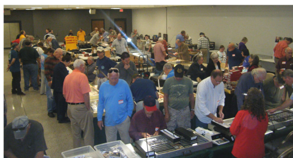
Photo: Bourse floor at the SBNS coin show.

The South Baldwin Numismatic Society held its annual Gold Coast Coin and Currency Show Jan. 14-15 at the Foley Civic Center, 407 E Laurel Ave., Foley, Ala. The show was free and open to the public.