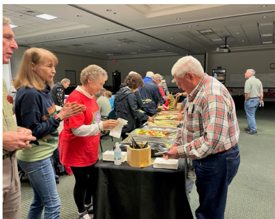
Photo: Mesa Coin Club members meet for holiday festivities on Dec. 7, 2022.