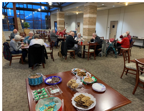
Photo: Mountain Coin Club members & guests enjoying dinner.