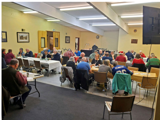
Photo: TLCC club members and guests at the club's 65th anniversary dinner in December. Thank you to all who attended!