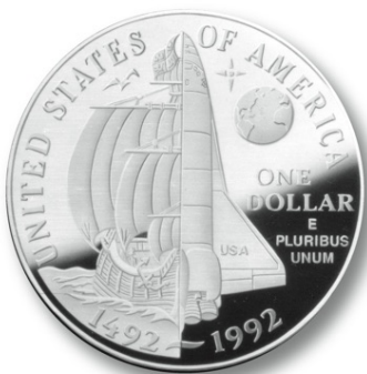
▲ THE 1992 CHRISTOPHER COLUMBUS quincentenary dollar morphs an image of the Santa Maria with the U.S. space shuttle Discovery .

space already has its own currency—sort of. In 2007 the foreign exchange firm Travelex launched the Quasi Universal Intergalactic Denomination, or QUID. (“Quid” also is a nickname for the British pound.) It was really just a marketing stunt, but, who knows, Travelex may be on to something! Depending on which perennial predic-