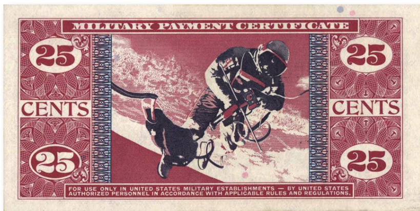
▲ MILITARY PAYMENT CERTIFICATES were issued to U.S. personnel stationed overseas. The reverse of this Series 681 25-cent issue depicts space-walker Major Edward H. White.