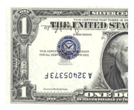
$1 bill with upside down serial numbers.

A nickel valued at $3 million and extraordinary misprinted currency among the attractions at family-friendly National Coin & Money Show®, March 8–10, 2018.