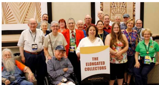
Photo: TEC members at the ANA convention.