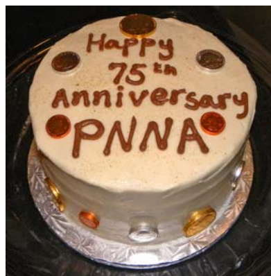
Photo: "Happy 75th Anniversary PNNA" coin cake at the Portland fall convention and coin show.

For information about the Willamette Coin Club, which has been active in the Portland area for more than 25 years, visit www.pdxcoinclub.org .