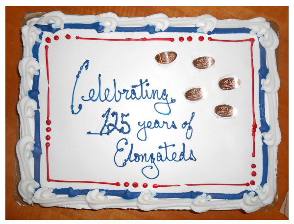
Cake "Celebrating 125 Years of Elongateds."

The TEC store is crammed full of elongated delights; visit it at <a href="https://www.tecnews.org/store/">https://www.tecnews.org/store/</a>. Elsewhere on the website, you can engage in various ongoing discussions, see what is happening in the wonderful world of elongateds and even join the funnest club in numismatics.