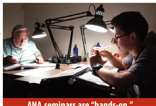
ANA seminars are "hands-on."