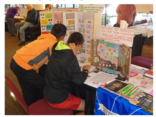
These two YNs working together on the Foreign Currency Country Match Game in Portland earned 25 of 33 pieces of currency.