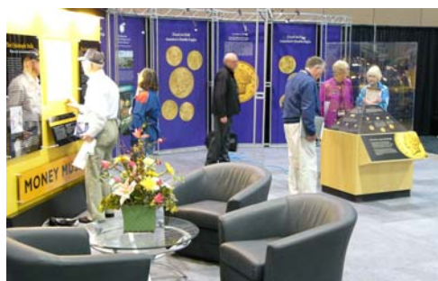
The ANA Museum Showcase.

We hope to see everyone at the ANA World's Fair of Money, August 10-14 at the Hynes Convention Center in Boston. Please check for updates at www.WORLDSFAIROFMONEY.com .