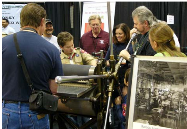
The Spider Press at the BEP booth.