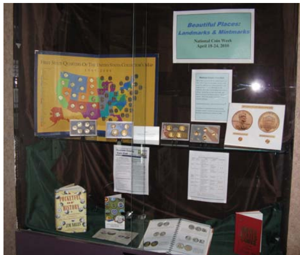
MCCC Exhibit at Madison Public Library during month of April 2010.

For National Coin Week, the Madison County Coin Club had a month long display in April at the City of Madison (AL) Public Library.