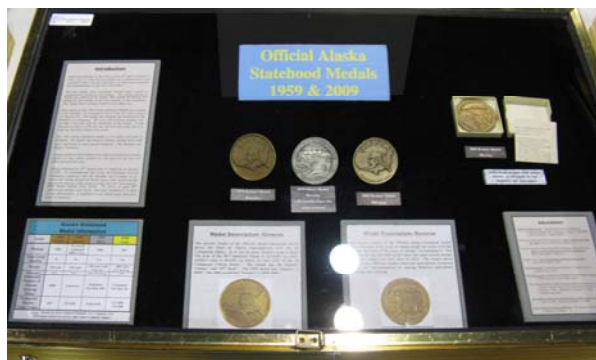
2010 National Coin Week Award Exhibit.