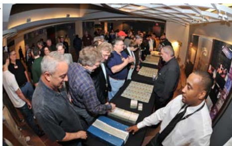
Kick-off event at the BEP's Western Currency Facility.