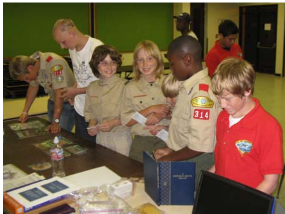
Boy Scouts on Kwajalein looking at numismatic items.

A story on this program is scheduled to be published in the June 2010 issue of The Numismatist .