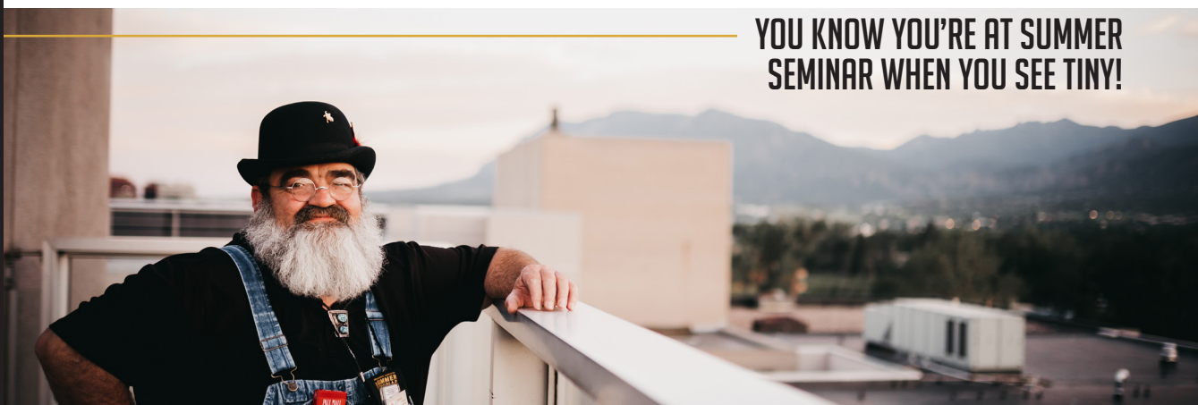
YOU KNOW YOU'RE AT SUMMER SEMINAR WHEN YOU SEE TINY!