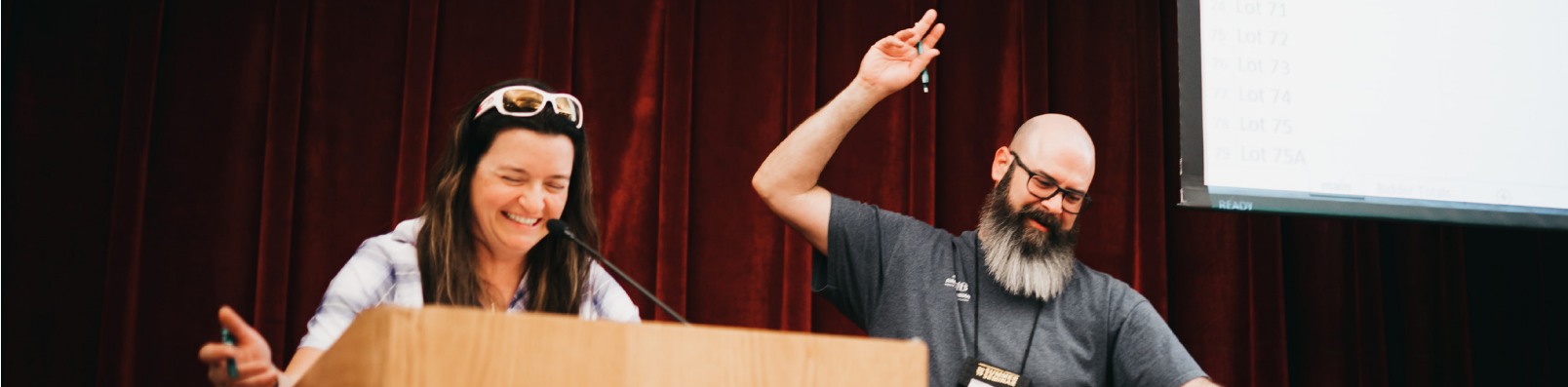
THE OFTEN-LIVELY YN AUCTION RAISES MONEY FOR FUTURE YN SCHOLARSHIPS EVERY YEAR.