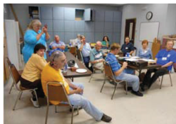
Photo: Madison County Coin Club members bidding during the auction on June 23.