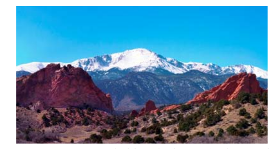
Summer Seminar is held at the base of Pikes Peak, America's Mountain.

'Advanced Study of United States Issues' is always a popular class.