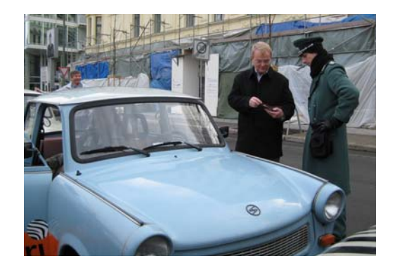
Photo: A club member trying to "bribe" his way through a "DDR Police Control" just beside the famous Checkpoint Charlie!

Friday started with a two-hour Trabi-Safari in East Berlin, which was a challenge for those of us that were appointed drivers. None of us had driven the old DDRproduced Trabant with 26 horsepower before!