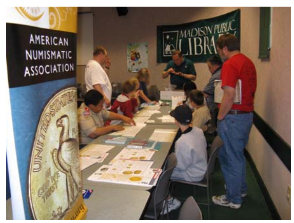
YNs working on the Lincoln Cents folders

On May 8-9, 2009, I had an ANA membership table at the Rocket City Coin Show in Huntsville, AL.