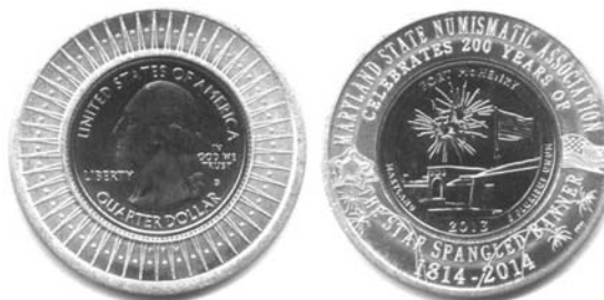
Photo: Fort McHenry encased quarter.

Celebrating the bicentennial of the Battle of Baltimore (Sept. 13-14, 1814) and of the Star-Spangled Banner, the encased Fort McHenry quarter was produced by MSNA. Collectors interested in obtaining their own P, D, or S-mint Fort McHenry encased quarters may contact MSNA at PO Box 13504, Silver Spring, MD 20911-3504 or visit the MSNA website, www.mdstatenumisassn.org .