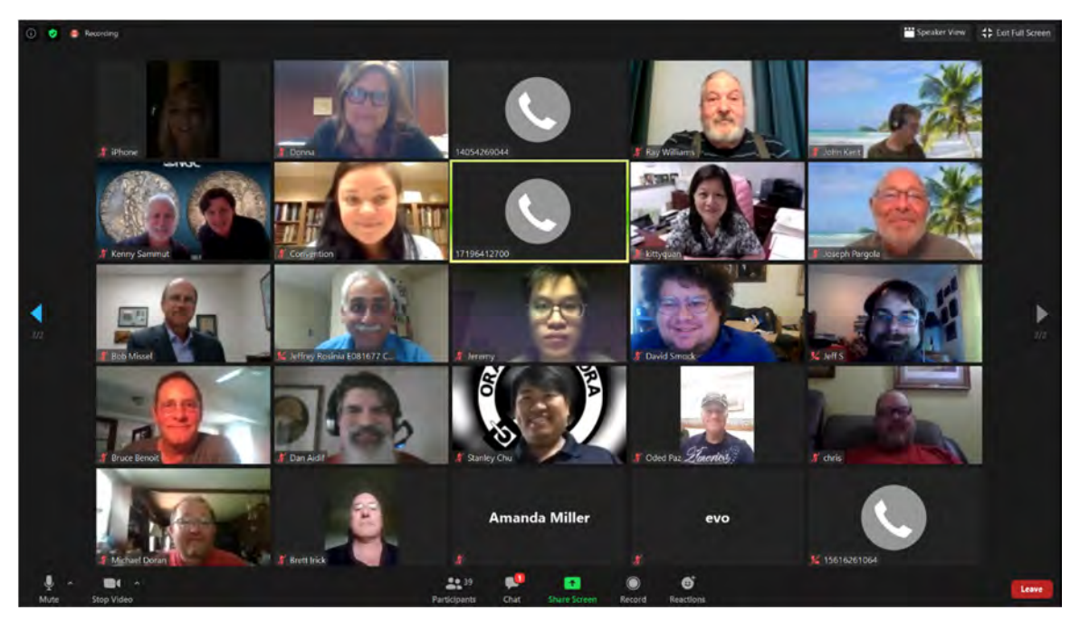
Screen Shot #2 from Annual District & Club Rep Meeting held on Aug. 6, 2020.