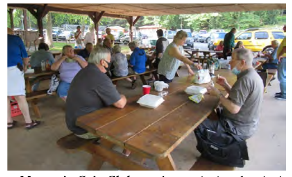
Mountain Coin Club members enjoying the picnic dinner provided by the club on Tuesday, July 14 in Blairsville, Ga.

The Mountain Coin Club met for the first time inperson since March on Tuesday, July 14, at Meeks Park in Blairsville, Ga. The club held a picnic dinner and auction outdoors since the club's normal meeting site was closed due to COVID-19. Many club members attended the meeting, and the club provided boxed sandwiches. The club's August and September 2020 meetings were also held outdoors at the same park.