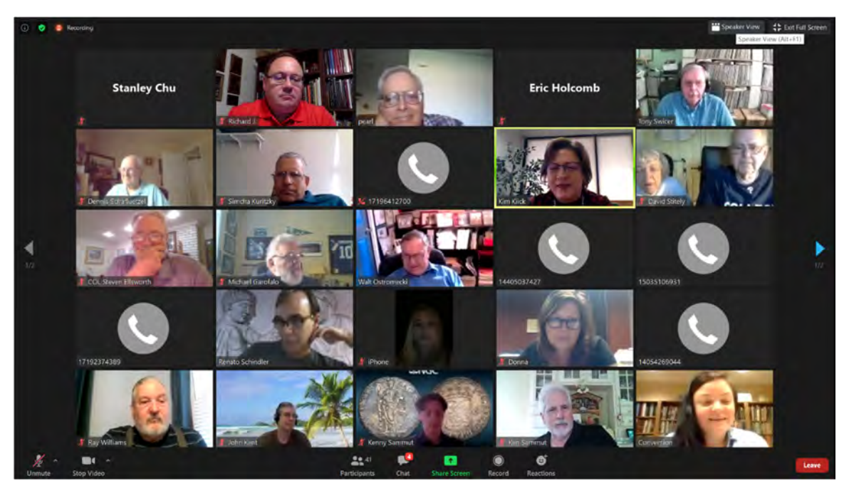
Screen Shot #1 from Annual District & Club Rep Meeting held on Aug. 6, 2020.