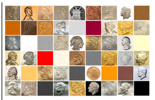
First place winning photo by WCC club president Jimmy Krozel.

The WCC canceled its March meeting due to COVID-19 and has held monthly meetings online since April. The meetings feature educational presentations and coins given away by random drawing. The club's October meeting included three numismatic quizzes.