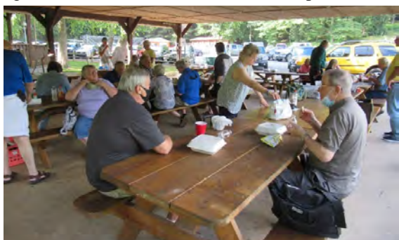
Mountain Coin Club members enjoying the picnic dinner provided by the club on Tuesday, July 14 in Blairsville, Ga.

The Mountain Coin Club met for the first time inperson since March on Tuesday, July 14, at Meeks Park in Blairsville, Ga. The club held a picnic dinner and auction outdoors since the club's normal meeting site was closed due to COVID-19. Many club members attended the meeting, and the club provided boxed sandwiches. The club's August and September 2020 meetings were also held outdoors at the same park.