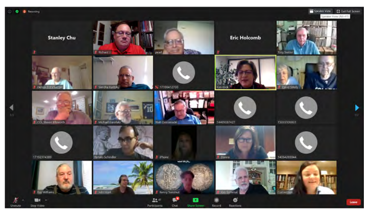
Screen Shot #1 from Annual District & Club Rep Meeting held on Aug. 6, 2020.