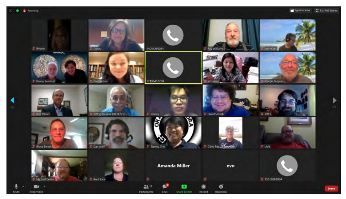
Screen Shot #2 from Annual District & Club Rep Meeting held on Aug. 6, 2020.