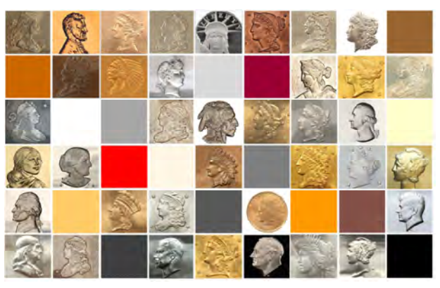
First place winning photo by WCC club president Jimmy Krozel .

The WCC canceled its March meeting due to COVID-19 and has held monthly meetings online since April. The meetings feature educational presentations and coins given away by random drawing. The club's October meeting included three numismatic quizzes.