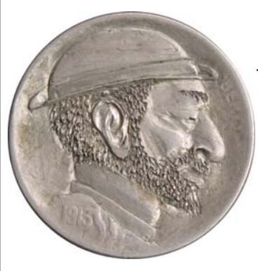
Photo: One of the hobo nickels offered for sale in the Jan. 2013 OHNS auction.

The Original Hobo Nickel Society (OHNS) wishes to announce its upcoming 2013 auction of hobo nickels. This event will be held in conjunction with the society's annual meeting which will take place on Jan. 12, 2013 at the F.U.N. Convention in Orlando. This annual event is the largest venue for the sale of high quality classic and contemporary hobo nickels.