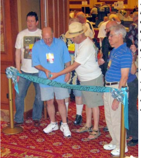
Photo: Ribbon-cutting ceremony at the CC&GTCC annual convention in Las Vegas.

The Casino Chip & Gaming Token Collectors Club, Inc. (CC&GTCC) concluded its 20th annual convention on June 23, held at the Southpoint Spa Hotel and Casino. It was a very successful convention.