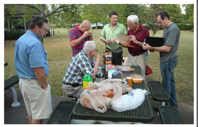
Photo: Activity at the Madison County Coin Club first picnic and bourse night.

The Madison County Coin Club held its first picnic and bourse night on Monday, June 25, outside of the Huntsville Senior Center. More than a dozen members and guests attended the event. Members brought food to share with their fellow collectors on the warm summer evening. A number of members also brought coins to sell and trade.