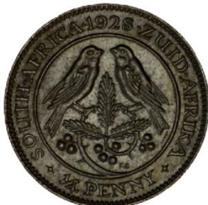
Lot 2: 1928 South Africa farthing; Almost Uncirculated, Brown