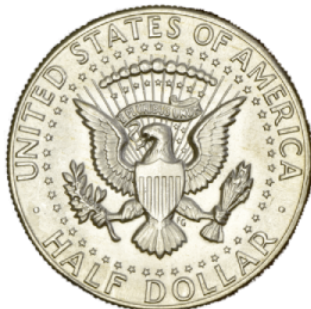
Lot 1: 1970-D Kennedy half dollar; Choice Brilliant Uncirculated