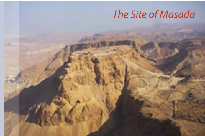
The Site of Masada

After the fall of Jerusalem, Titus returned to Rome to meet his father, leaving Lucilius Bassus to wipe out the remaining pockets of resistance. Bassus commanded the legion X Fretensis. However, he died before he could complete his mission. The job was taken over by Lucius Flavius Silva. Silva's men, numbering about 10,000, attacked the last Jewish garrison at Masada in 73 A.D.