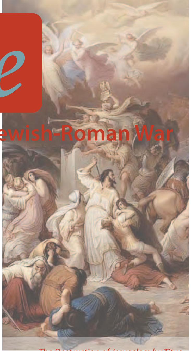
The Destruction of Jerusalem by Titus

Specifically, the arch was constructed to commemorate Titus' victory in Judea, which the Romans viewed as a great military accomplishment. On one side of the arch's interior, a relief sculpture depicts Roman soldiers returning from the sack of Jerusalem, bearing their spoils. This sculpture is the only existing contemporary depiction of the stolen sacred items, including the temple's large, seven-branched menorah. The menorah is important to Jewish religion and its image was used as a basis for the Emblem of Israel.