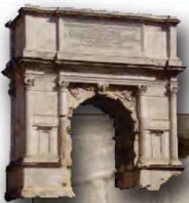
Arch of Titus and the Sack of Jerusalem