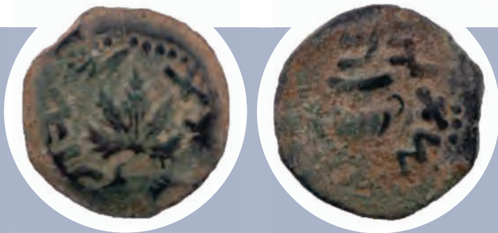
This coin of the First Jewish Revolt, struck in Judea, would have been used to pay army expenses.

On Tisha B'Av (July 29 or 30) of the Jewish calendar, the Romans destroyed the sacred Jewish Temple. The first Jewish Temple, Solomon's Temple, was destroyed on the same date by the Babylonians over 500 years before. Tisha B'Av, the ninth day of the Jewish month of Av, is still observed by Jews around the world.