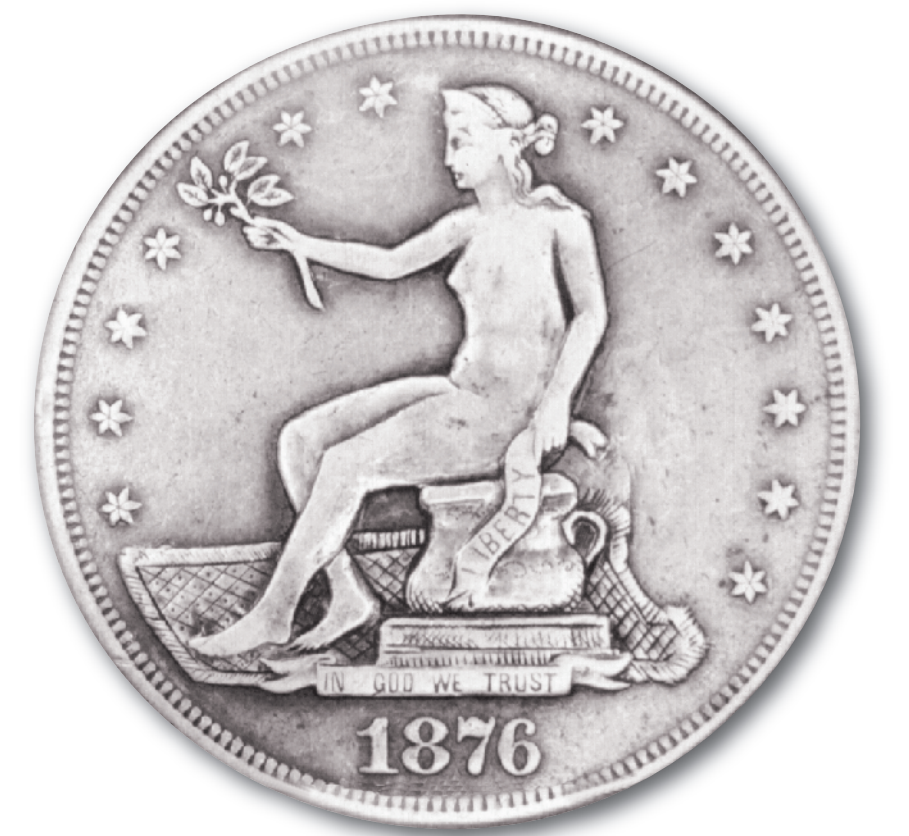
Altered 1876 Trade dollar ("potty dollar")

The alteration of coins by engraving dates back to at least the 17th century or earlier in England. Beginning in the 1850s, coin alteration in the United States became popular with examples such as the “potty dollar” engraved on Seated Liberty and Trade dollars. The period of the 1860s through the first decade of the 20th century was the heyday of the love token, which was made by grinding one or both sides of a coin smooth and then engraving it with various designs, monograms, or initials. The love token faded out in the early 20th century as the hobo nickel was created.