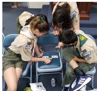
Photo: Scouts BSA team working on 'theory' grading requirement at the virtual CCMB clinic sponsored by the Glendale Coin Club and NASC.