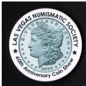
Photo: The special LVNS 60 th Anniversary Coin Show casino token obverse. (The reverse depicts the Sahara Hotel in 1963 and the Palace Station Hotel in 2023.)

The LVNS celebrated its 60 th Anniversary Coin Show and its annual ANA Summer Seminar youth scholarship raffle at the Palace Station Casino in Las Vegas, Mar. 24-26. A casino token commemorating the LVNS's 60 th anniversary, in a limited edition of 300, was produced.