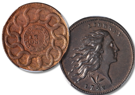
Fugio cent of 1787 / U.S. Mint large Liberty Head cent struck from 1793 to 1799.