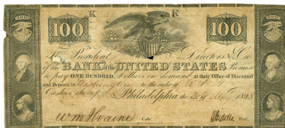
1828-dated Bank of the United States $100 note.