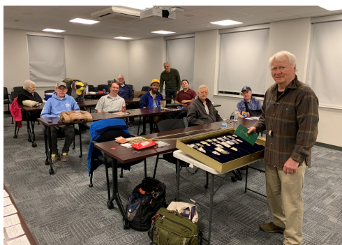
Photo: Classic City Coin Club members at Nov. 13 Meeting.