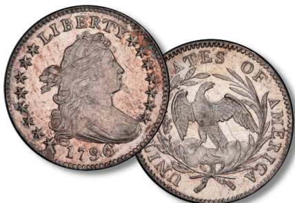
1796 example of first U.S. Mint dimes.