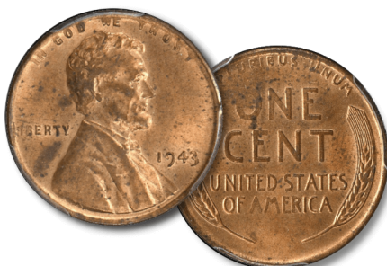
1943 Lincoln cent mistakenly struck in copper/bronze alloy, and a 1944 cent struck on a zinc-coated steel planchet intended only for 1943 cents.