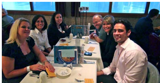
ANA members relax during the Kickoff Event, which was a boat ride and dinner on the Gateway Clipper . The event included a scenic view of Pittsburgh from the water, dinner and live music.