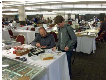
A father and son collecting together at the PNNA-Willamette fall show.