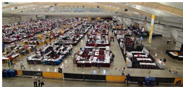
A view of the bourse floor from the upper skywalk at the David L. Lawrence Convention Center in Pittsburgh. There were more than 300 dealer tables at the show.

Each club will be provided with one free display case. Additional cases must be rented by the club at the standard cost.