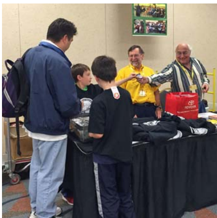
Registration at the PANKidZone.

PAN is committed to the future of collecting that is vital to the survival of this wonderful and family-engaged hobby.