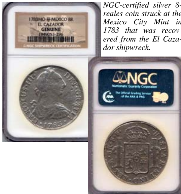
NGC-certified silver 8-reales coin struck at the Mexico City Mint in 1783 that was recovered from the El Cazador shipwreck.