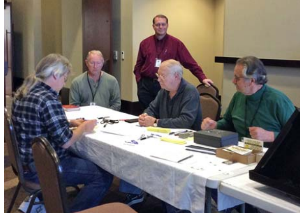
Action at the Augusta Coin Club fall show.

The Augusta Coin Club fall coin show in November was a great success, with 29 dealers occupying 52 tables, and the club making a profit. This was the club's fourth show at the Columbia County Exhibition Center, and it was enjoyed by all in attendance. Plans are being made for a spring show May 13-14, and a fall show Nov. 18-19.