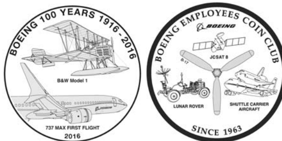
BECC medal commemorating Boeing 100 Years.