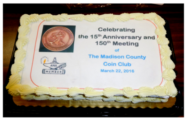
Special cake to celebrate the 15<sup>th</sup> Anniversary and 150<sup>th</sup> Meeting of the MCCC.

The 150<sup>th</sup> meeting of MCCC will be in November 2016. MCCC has been a member of the ANA since the founding of the club.