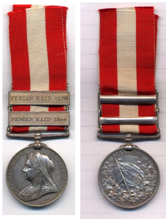
Images: Canada General Service Medal honoring those who fought during the Fenian Raids.

The Regina Coin Club Show and Sale takes place at the Turvey Centre, just north of Regina. The show runs from Oct. 15-16.