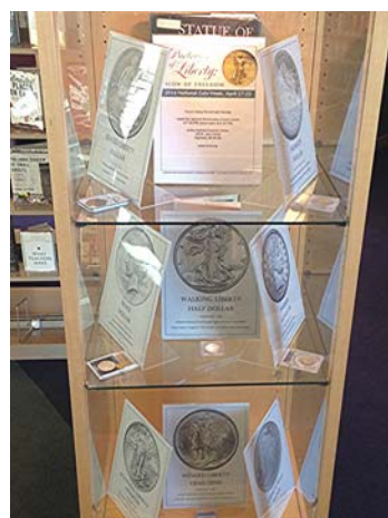
Photo: HVNS National Coin Week display in the public library in Milford, Michigan.

The Huron Valley Numismatic Society had a busy first six months. Besides having monthly informative programs and speakers, the club hosted a spring coin show in March. April's National Coin Week was celebrated with an impressive coin display created by club members at the Milford Public Library, for the sixth year in a row. On May 14, an exhibit by the club opened at the Milford Historical Society Museum. The theme? ... Before there were credit cards, debit cards and online coupons, there were "Milford Tokens and Medals." In June, HVNS sponsored a free coin appraisal night at the library.