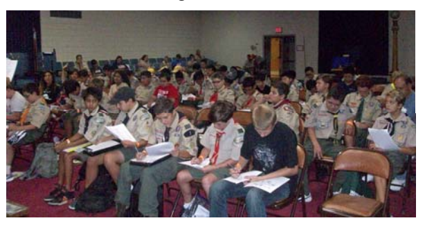
Photo: Boy Scouts participating in the merit badge workshop at the Golden State Coin Show.

The workshop brought in 83 scouts and more than 40 scout leaders and their families to the annual Golden State Coin Show (GSCS) sponsored by the Numismatic Association of Southern California (NASC) at the Arcadia Masonic Center, Aug. 26-27.