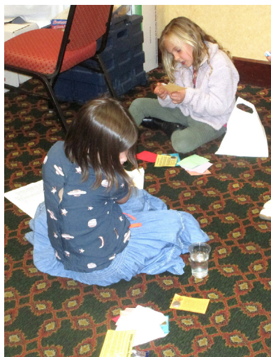
Photo: Two girls, ages 8 and 9, look over their coin treasures after completing the youth-family treasure hunt activity.

The LVNS owes kudos and heartfelt thanks to all our club members who volunteered and worked tirelessly to make the coin show a huge success!