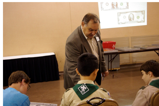
Photo: Scouts receive hands-on learning opportunities in the workshop. Action here deals with the currency block. Scouts are viewing and looking over an actual U.S. $500 bill!