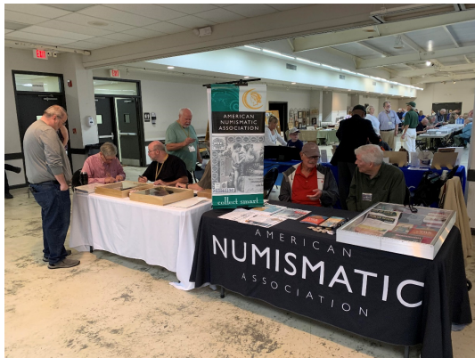
Madison County Coin Club's membership table at left and ANA membership table at right at HUNTSPEX 2024 Stamp, Postcards and Coin Show.

The Madison County Coin Club (Huntsville, Ala.) had a club membership table for the second year in a row at the HUNTSPEX 2024 Stamp, Postcards and Coin Show in Huntsville, Ala., June 1-2. The club signed up many new members. The ANA also had a membership table next to the MCCC club table.