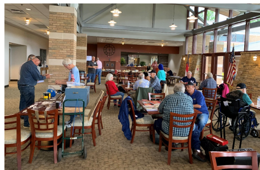
Mountain Coin Club members and guests at annual picnic dinner.