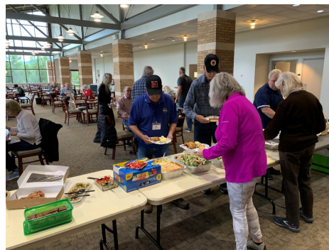
Mountain Coin Club members and guests at annual picnic dinner.

The Mountain Coin Club held its annual picnic dinner at its May 14 meeting. The club provided the food and drinks, and members were asked to bring a dessert to share. There was a large turnout of members and guests for the event.