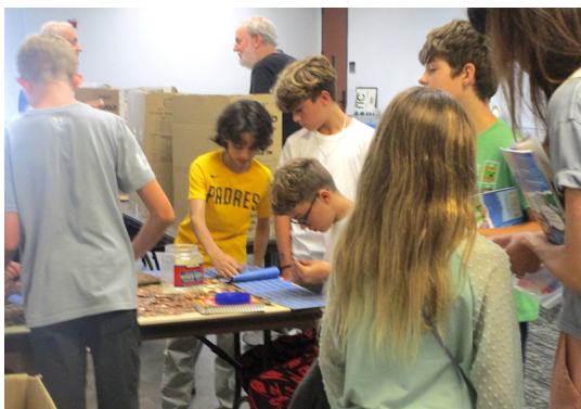
Photo: Youngsters having fun at the Penny Search Youth Table while building a starter coin collection.